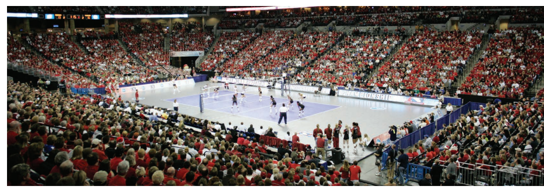
Nebraska shattered NCAA single-match and all-session records at the 2006 NCAA Championships in Omaha, drawing 34,222 for the two matches, including a then-NCAA record crowd of 17,209 for the title match against Stanford. At the time, that was the largest crowd to ever see a volleyball match in the United States.

- Cook following the national title match