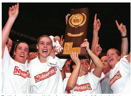
The Huskers celebrate with the championship trophy following their win over Wisconsin in the 2000 NCAA Championship match.